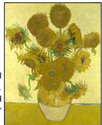
Van Gogh's Sunflowers