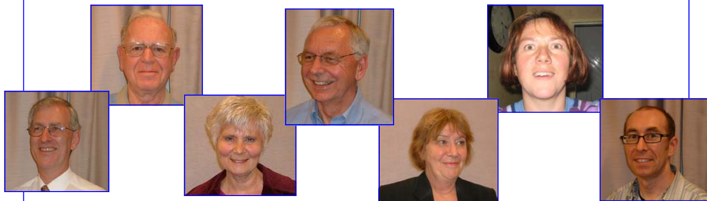
The Trustees - Left to Right: