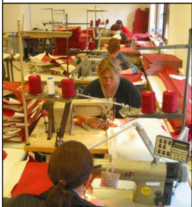
Sewing Upholstery for Buses

Bromley and their twin town of Neuwied, in Germany, have had exchanges for 20 years. Town twinning specifically aims to build strong personal relationships and understanding between people of different countries and cultures. Many contacts and friendships have been forged between the citizens of the two towns and the hospitality that visitors from Bromley have received in Neuwied has been overwhelming; we aim to offer equally warm hospitality in our Borough too. The Bromley / Neuwied carnivals are just a couple of the annual events that are shared, and we now hope to strengthen our friendship with an organisation called 'Informa'.