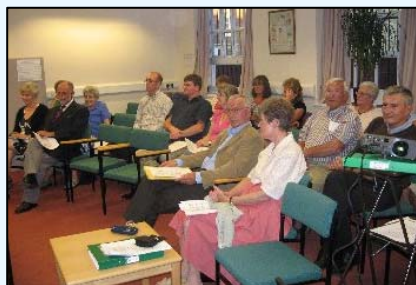
AGM - 24 July