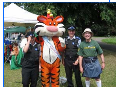
Beckenham Lions Club Fete